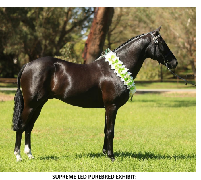
SMART VC (Kristie Morrone)