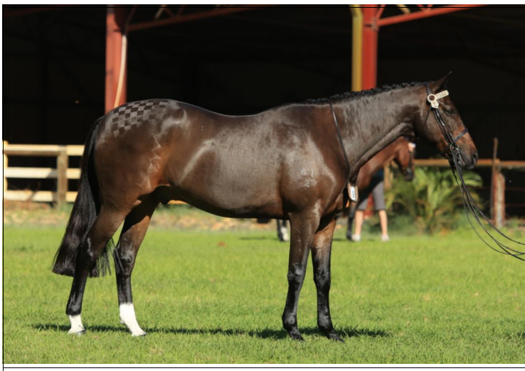
Supreme Champion Led Partbred: DEVILS CHOICE (Carly Spillman)