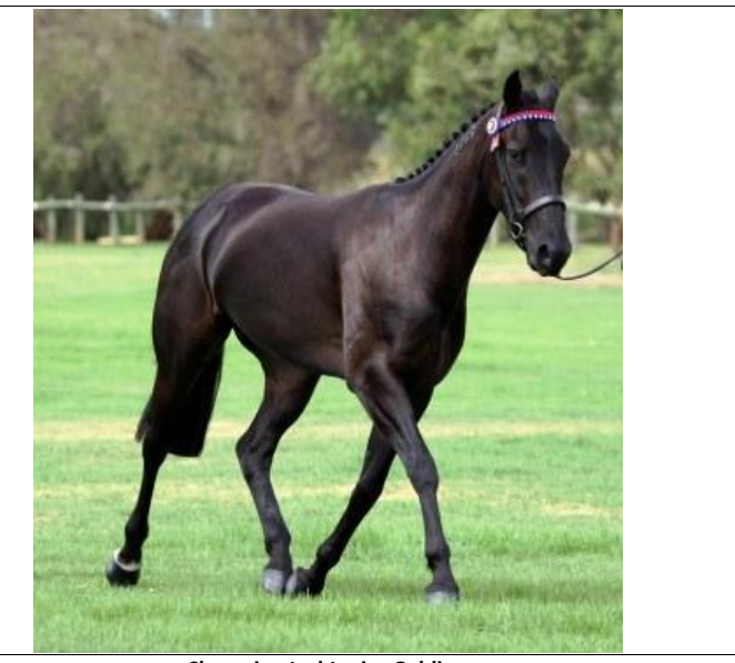
Champion Led Junior Gelding: LIBERTY PARK NOIR (Dee Sampson)