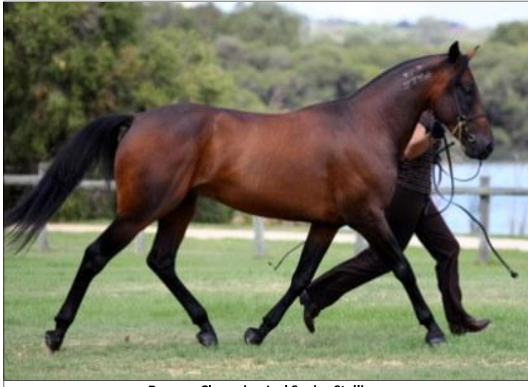
Reserve Champion Led Senior Stallion: ALISTAIR BROMAC