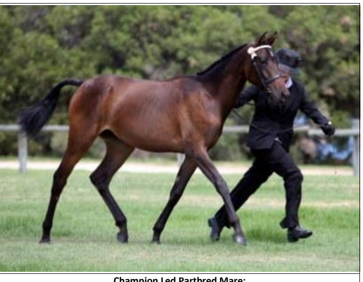
Champion Led Partbred Mare: SADEEK SCOTTISH LASS