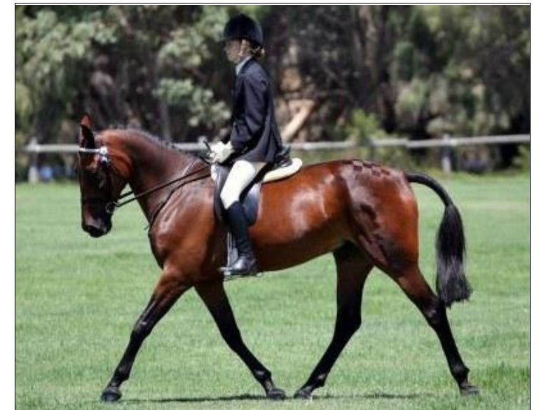
Champion Ridden Hack Over 15hh \ Heavyweight Hack: MR BUCKLEY (Heather Woodley)