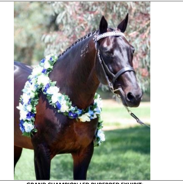
GRAND CHAMPION LED PUREBRED EXHIBIT: ADMIRAL'S CHRISTMAS (Kristie Morrone)